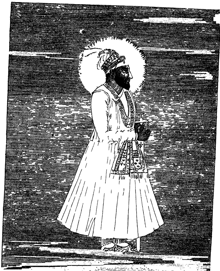
THE EMPEROR SHAH ALAM

[From a plate in Frauchlin's 'History of the Reign of Shah Aulum']